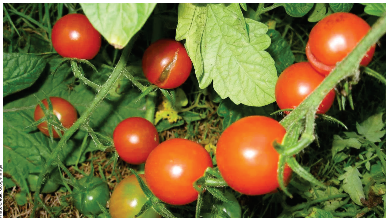
Tomato Blossom Drop

he Governor of the Central Bank of Nigeria (CBN), Mr. Godwin Emefiele, has revealed the success of the multi-sectoral agricultural intervention programmes of the Bank while reiterating the commitment of the Bank to encouraging the tomato value chain to satisfy the need of Nigerians and bridging the deficit of about 1.2 million tonnes valued at about $2.5 billion annually.