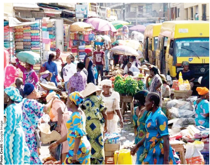
Lagos Island Market

he Governor of the Central Bank of Nigeria (CBN), Mr. Godwin Emefiele while briefing the Press on the outcome of 271st meeting of the Monetary Policy Committee (MPC) held on January 23 and 24, 2020, has hinged the continuous growth witnessed in the economy on the enhanced credit flow to the private sector to improve manufacturing activities.