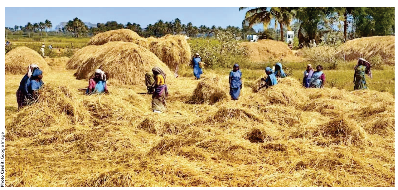
Kebbi rice farmers during harvest

ice farmers in Kebbi State under the auspices of Rice Farmers Association of Nigeria (RIFAN), Kebbi State chapter, has said that its members recorded a bumper harvest of 3.5 million metric tons of rice during the last rainy season.