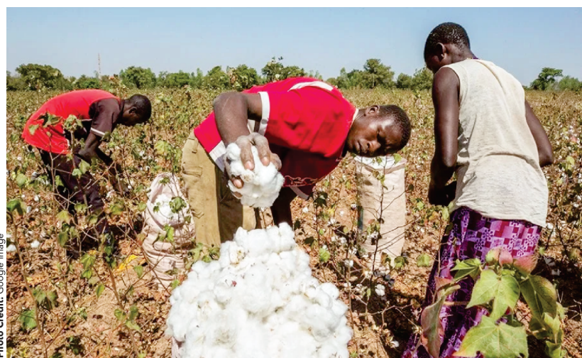
Ekiti Cotton Farmers

entral Bank of Nigeria (CBN) has assured Ekiti State chapter of National Cotton Association of Nigeria (NACOTAN) of its financial support to enable them embark on massive production of cotton.